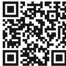
Parish Website QR Code

10am-2pm The Lounge Esplanade Hall 9.30-11am Little Saints Toddler Group Millennium Room (term time)